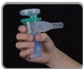
Ergonomic Bottle Design